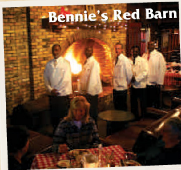
Bennie's Red Barn

For a great time in a casual atmosphere, join all your friends at Spanky's. Spanky's Marshside provides dramatic views of the Marshes of Glynn while the Mallside location is directly across the street from Glynn Place Colonial Mall. See their ad on page 32.