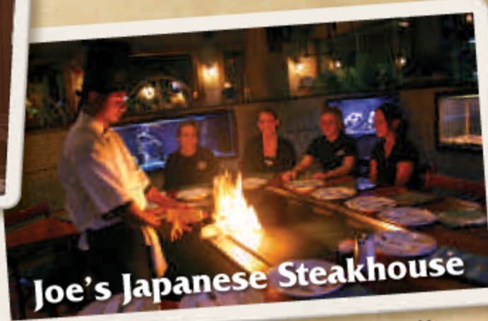
Joe's Japanese Steakhouse