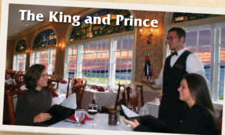
The King and Prince