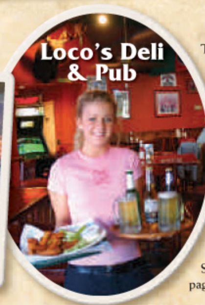
Loco's Deli & Pub

Locals and visitors in the know are certain to head to the King and Prince Beach & Golf Resort for the famous Sunday brunch! You simply can't beat the ocean view in the elegant main dining room. See the ad on page 33.