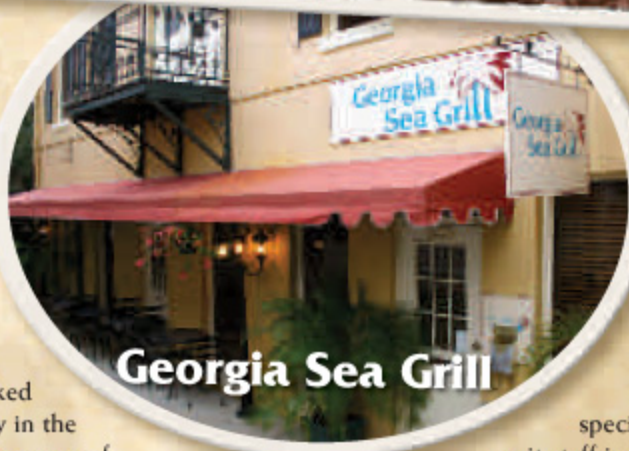
Georgia Sea Grill

Where there's fire, there's flavor at Joe's Japanese Steakhouse next door to Spanky's. You're just a short stroll away from Glynn Place Colonial Mall in Brunswick. See ad on page 32.