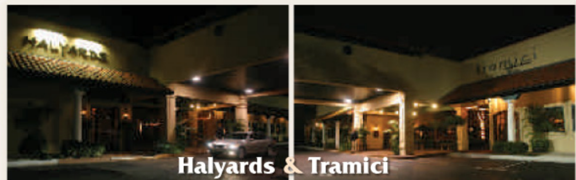
Halyards & Tramici

Dave Snyder sure knows how to do things right—Two beautifully appointed restaurants side-by-side with valet parking to boot! Halyards has earned an enviable regional reputation for superb coastal cuisine in elegant, comfortable surroundings.